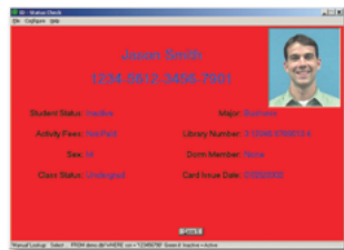
Red: Access Denied

PockeTracker and RapIDTrack Red/Green are powerful and efficient identity management tools that can meet any tracking and verification need. The PockeTracker "Go Anywhere" entry access management system was designed to be easy to use and highly user configurable, while it easily fits in the palm of your hand. RapIDTrack is a desktop version of our tracking software that can be installed on a PC.