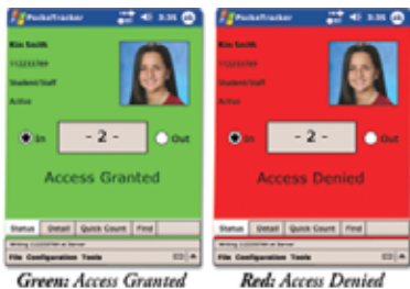
Green: Access Granted